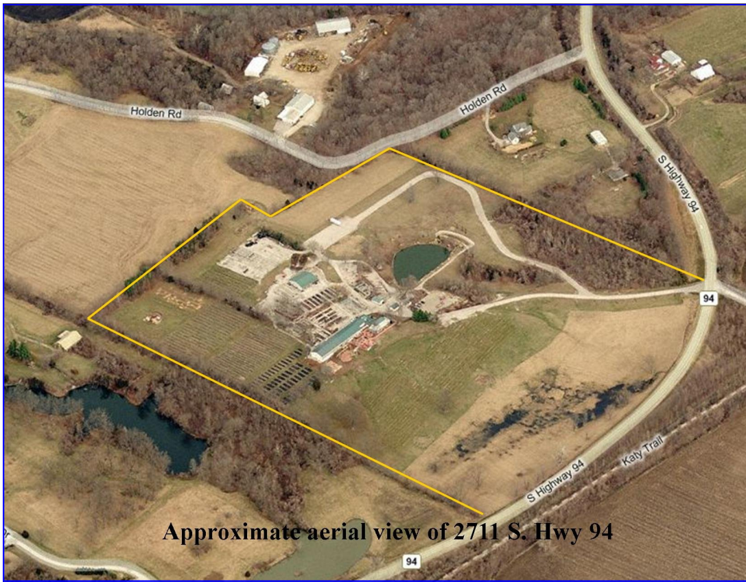
Approximate aerial view of 2711 S. Hwy 94