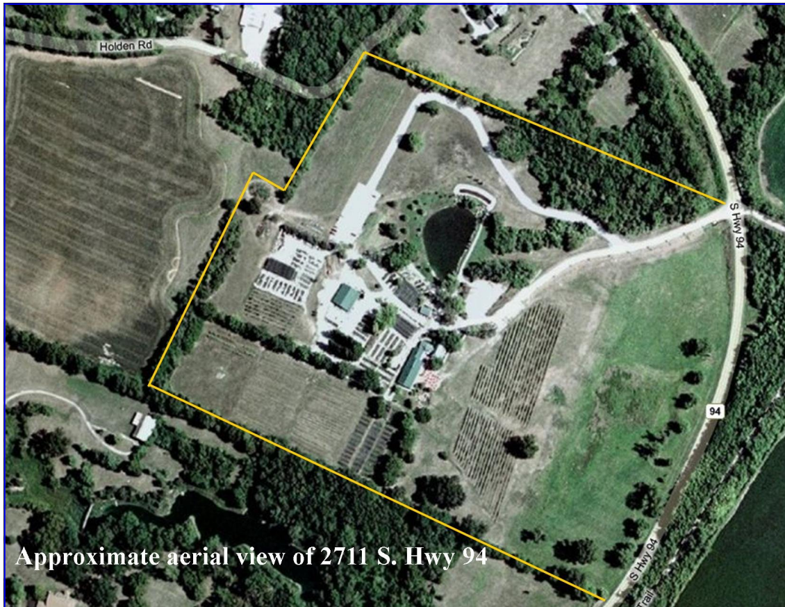
Approximate aerial view of 2711 S. Hwy 94

The information contained herein has been supplied to us by the owner of this property or by a third party. Tom Shaw Realtors does not guarantee its accuracy and recommends buyers or tenant to verify all information herein and to obtain a full boundary survey before buying said home or property. PRICES AND SPECIFICATIONS ARE SUBJECT TO CHANGE WITHOUT NOTICE