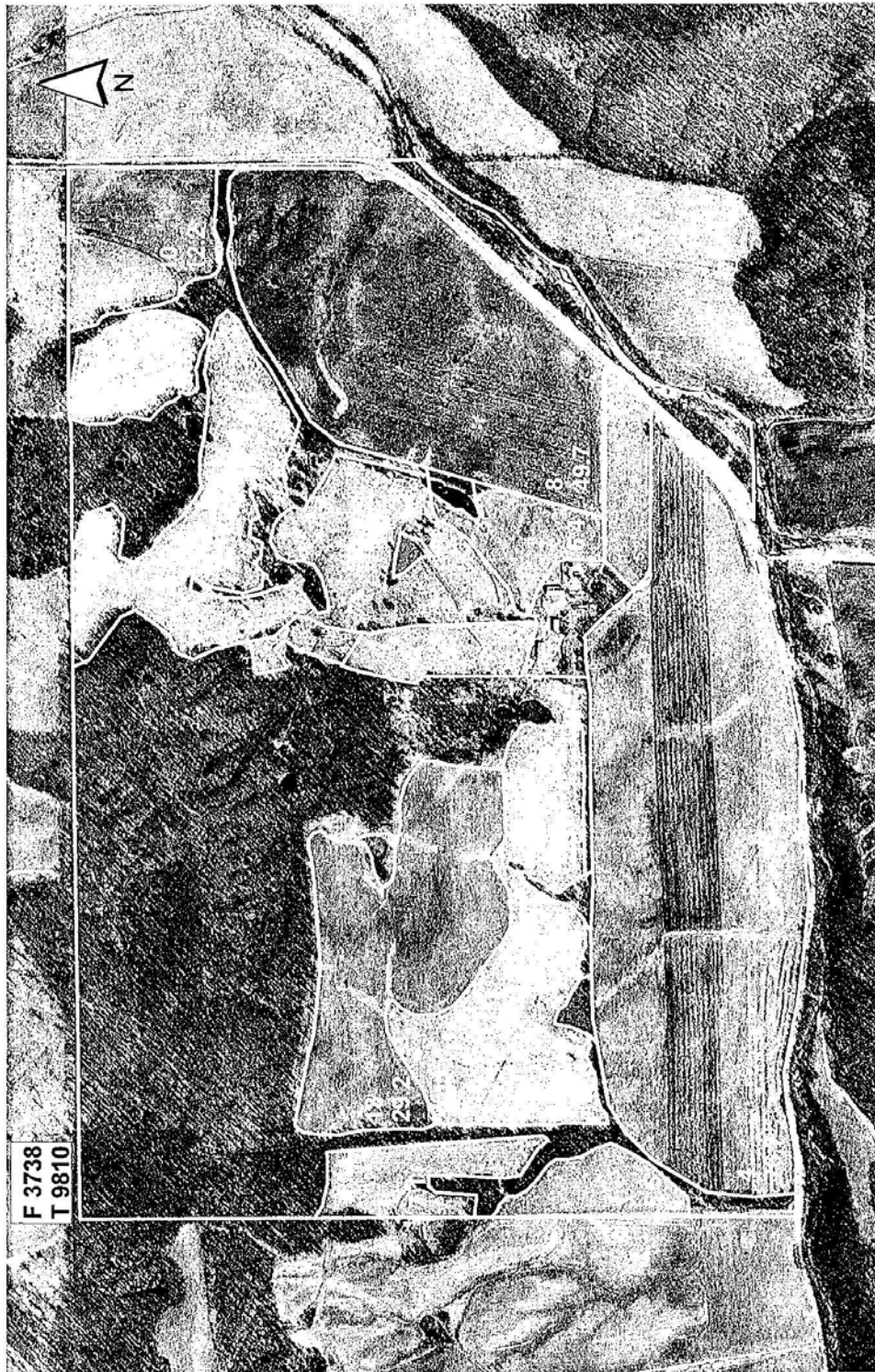
Map Created March 29, 2004 700 0 700 1400 Feet

The information contained herein has been supplied to us by the owner of this property or by a third party. Tom Shaw Realtors does not guarantee its accuracy and recommends buyers or tenant to verify all information herein and to obtain a full boundary survey before buying said home or property. PRICES AND SPECIFICATIONS ARE SUBJECT TO CHANGE WITHOUT NOTICE